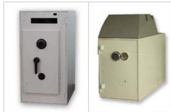
** ATM Safe