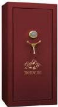
** Burglary resistance safe