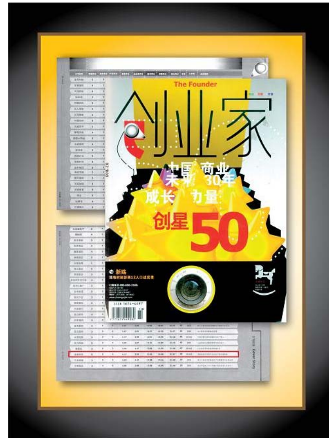
50 Best Creative Company