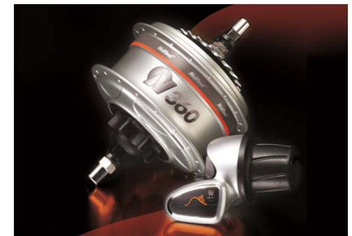
** Nuvinci Hubs